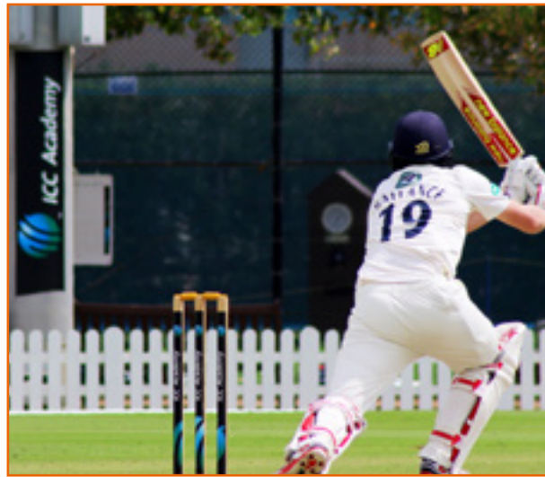
Lancashire CCC training at ICC Academy