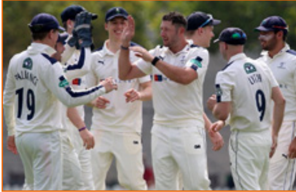
Yorkshire CCC training at ICC Academy

After lunch, transfer to game 2 at the at the world class ICC Academy, Dubai Sports City.